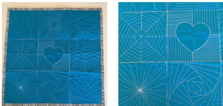
Walking WOW Sampler and Close-up