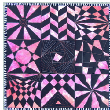
Mod Mola Sampler